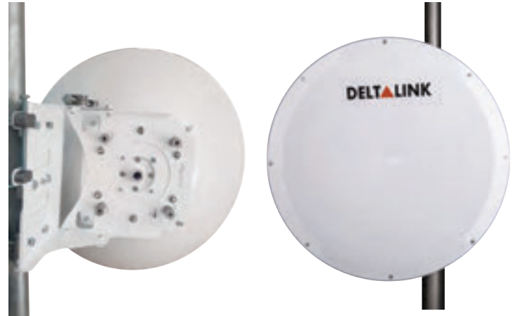
11.7 Ghz E-Plane